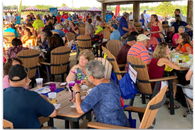
Sip & Savor