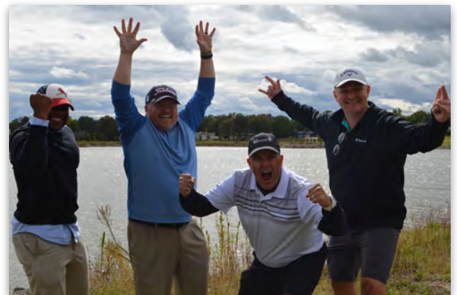
Annual Golf Tournament

Includes after golf networking, drinks, and hors d'oeuvres.